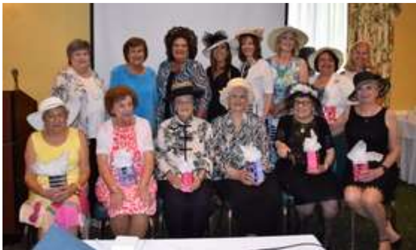
Philoptochos Past Presidents Luncheon